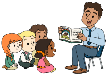
LinCt Teachers Needed!

*Sunday Worship times beginning September 21 st *