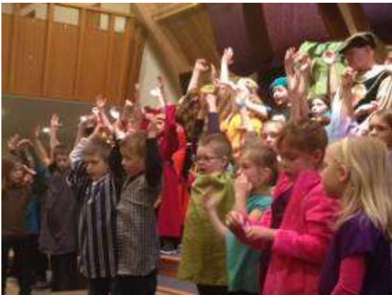
Children's Musical "What's Up Zac?"