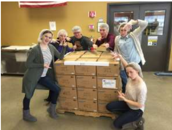
Our Savior's – Feed My Starving Children 2016