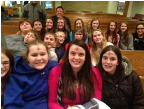
Ash Wednesday Worship Our Savior's Youth

Thank you to all the cooks, servers and clean-up crews who made our Lenten Suppers. Every meal was delicious and the enthusiasm of all the volunteers was wonderful to see. Thanks to all the youth and music team members for the meaningful worship.