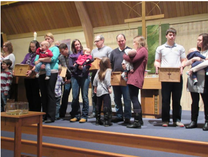
Recognition of Holy Baptism Sunday, January 11, 2016