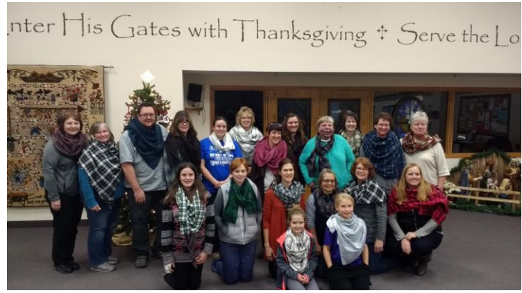
IDEAS Group – Scarf Making – Dec. 4

Copies of both Christ in Our Home and The Lutheran are available in the social hall. Please help yourself to a copy!