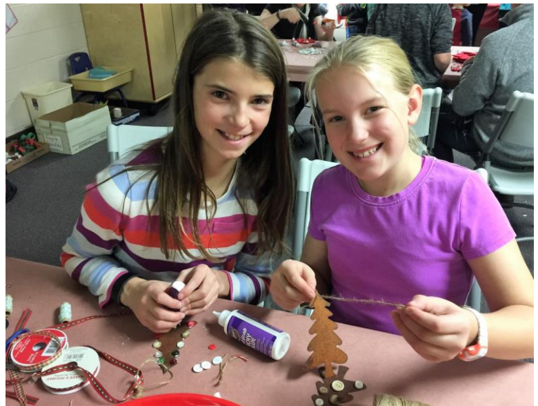
2016 Advent Festival