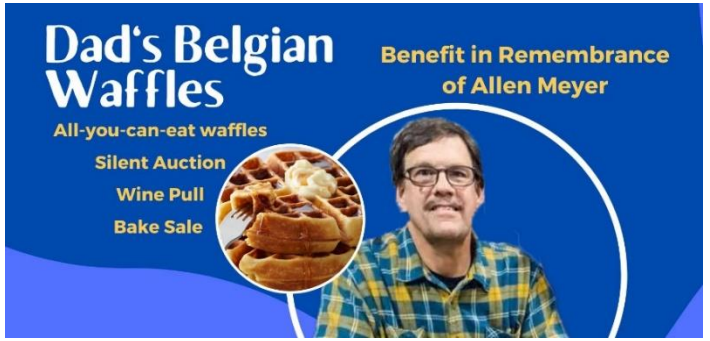
Sunday, March 19<sup>th</sup> from 9:00 AM – Noon Courtland Community Center, 300 Railroad Street, Courtland, MN 56021

Please join them for a Taco Bar (suggested donation of $15 for Adults, $5 for Children 5 and under), a Silent Auction, Wine Grab, and Kids Area. Donations may also be made at <u>https://gofund.me/cd4b7e0f</u>.