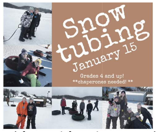
Watch for more information to come, this event is weather dependent.

Bible Camp registration opens December 14<sup>th</sup>. We have spots reserved through January 18<sup>th</sup>. Early Bird discount of $50 per camper ends February 15<sup>th</sup>. **camp mailing will be sent soon**